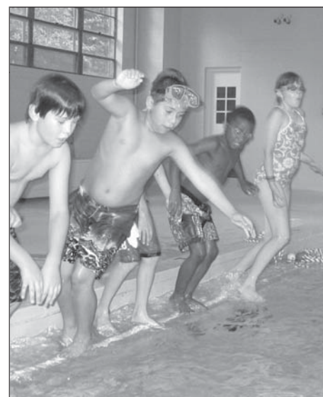
Swimmers... Take your mark... Get set... GO!!