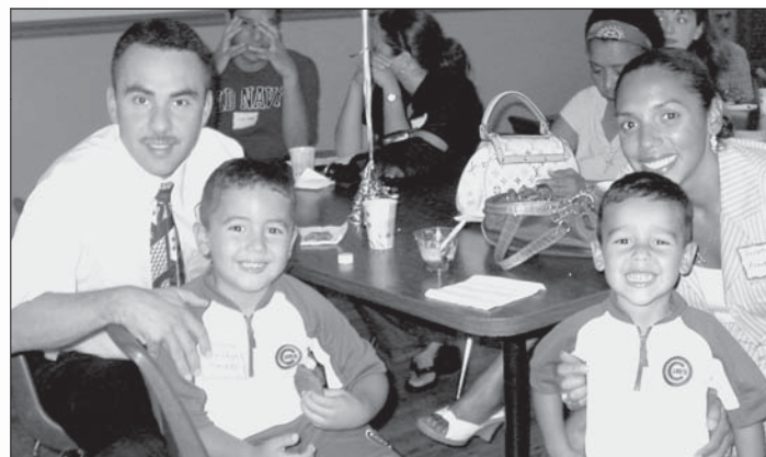
The Acevedo Family