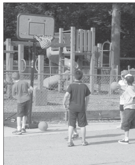
Lower School boys practice their skills in a lively basketball game.